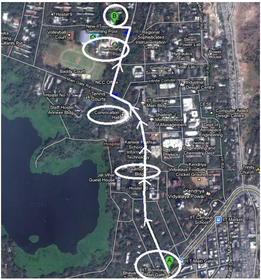
Fig 2: IIT Main Gate - Hostel 1

Hostel 1 (point B on the map) is opposite to the Student Activity Center (SAC)/Swimming pool.